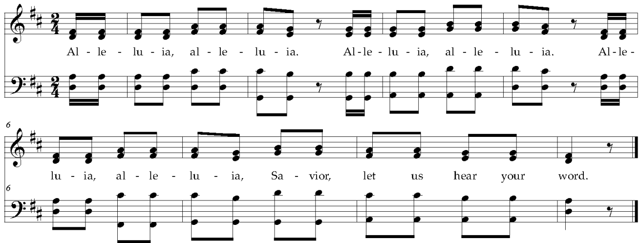
Tune from Honduras. Arrangement 1995 WGRG, Iona Community, Glasgow. Used by permission CCLI 11110659